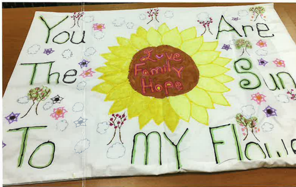
Hospice Bereavement client Casey Brolliar, age 16, created this Pillow Case Art Project at an off-site school program